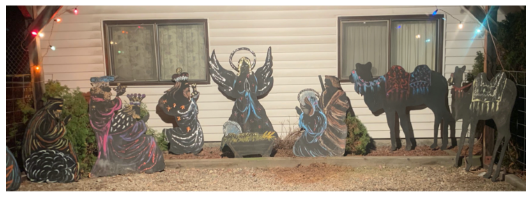
See the life-size Nativity scene beneath the canopy in front of the Museum.

You are cordially invited to bring your family and friends